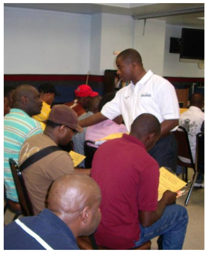
an active member of the Criminal Temporary Protected Status (TPS)Drive in and Social Justice Committee. North Miami 2010

When the devastating earthquake occurred in Haiti in January 2010, helped Mavor Pierre mobilize initiatives to collect recovery funds. Mayor Pierre collaborated with the Honorable David N. Cicilline, Mayor Providence (R.I.), and the Honorable C. Ray Nagin, former Mayor of New Orleans (LA), to introduce and lead the passing of a resolution in support of Haiti at the United States Conference of Mayors Winter meeting. This was very important to Mayor Pierre not only as a member of the Haitian Diaspora, but also for the large number of residents in North Miami whom are also of Haitian descent. He was also appointed as the co-chair of the Comprehensive Immigration Reform Task Force for the U.S. Conference of Mayors. The task force developed to guide legislative efforts on immigration reform. Prior to his appointment, Mayor Pierre was also and Social Justice Committee.