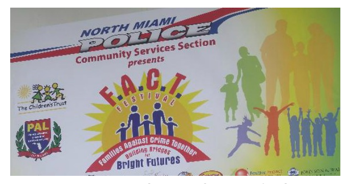
Banner at the F.A.C.T Festival

For the past four years, crime has significantly reduced in the city of North Miami. It is through different police initiatives and with the support of the community, especially the residents of the city of North Miami, that North Miami the Department (NMPD) is reporting the lowest crime rate in 33 years. As recently reported in the North Miami Police Department 2012 Annual Report, several uniform crime