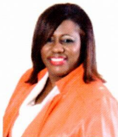
Clerk of the Courts Broward County, Florida 17th Judicial Circuit